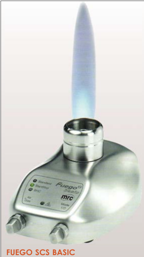
FUEGO SCS BASIC

Fuego-SCS-Basic: More than standard The Fuego SCS basic can be safely operated by means of the supplied foot pedal or the button function. Different programs are available: a flexible start-stop function or the conventional foot pedal control for short-time applications. In addition, the flame can be started and stopped by briefly pressing on the function knob.