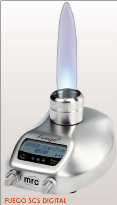
FUEGO SCS DIGITAL