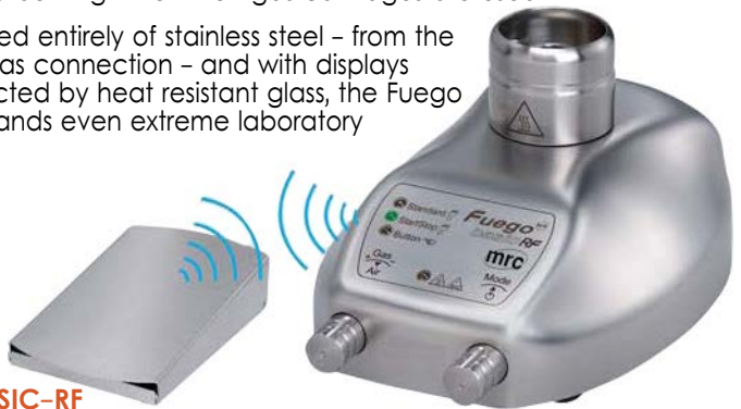
FUEGO SCS BASIC-RF

Robust Fabricated entirely of stainless steel - from the controls to the gas connection - and with displays which are protected by heat resistant glass, the Fuego SCS Series withstands even extreme laboratory conditions.