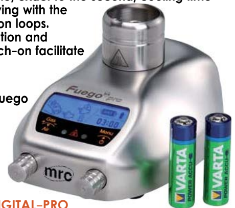
FUEGO SCS DIGITAL-PRO

SCS pro provides maximum flexibility. Wireless operation using state-of-the-art rechargeable battery technology guarantees independent operation. Two standard rechargeable batteries allow up to 9 hours of continuous operation. This corresponds to approximately 2000 inoculation loop flaming operations. The Fuego SCS pro has an integrated fast charging function and can be recharged in only 3 hours. The range of functions is identical to those of the Fuego SCS.