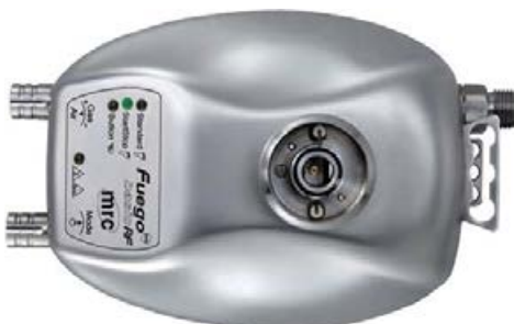
FUEGO SCS BASIC-RF

Fuego-SCS-Digital: Versatile The Fuego SCS can be operated with the touch-free IR-Sensor, button function or foot pedal (optional). For all options, different programs exist that have been developed on the basis of practical experience: flexible start-stop functions, continuous application for up to 2 hours or programs for short flame sterilization - exact to the second.